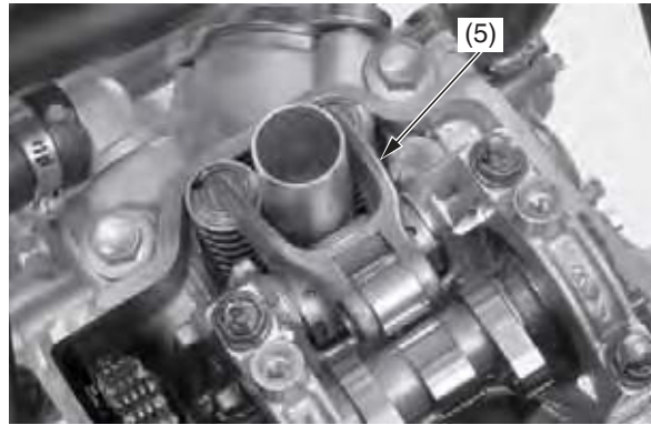
(5) exhaust rocker arm