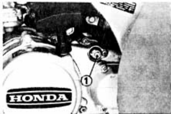
(1) Neutral indicator

The indicator rotates as the gears are changed. When the indicator aligns with the “N” mark on the crankcase, the transmission is in neutral.