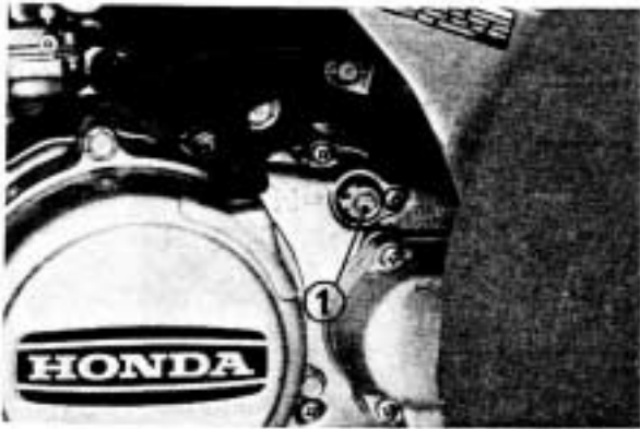
(1) Neutral indicator

The indicator rotates as the gears are changed. When the indicator aligns with the "N" mark on the crankcase, the transmission is in neutral.