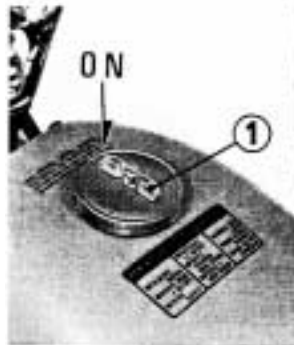
(1) Cap lever