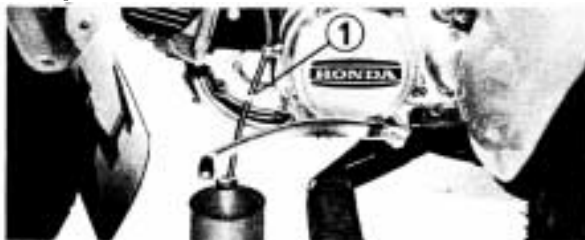
(1) Carburetor drain tube