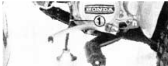
(1) Carburetor drain tube