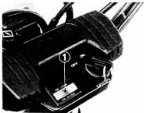
(1) Reverse indicator lamp