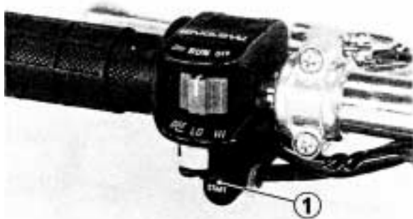
(1) Starter button

* When the posi-torque speed range and reverse selector lever is in reverse position, the starter motor will not work.