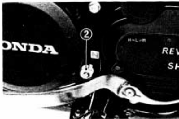
(2) Neutral indicator

The neutral indicator (2) is on the left crankcase cover, just behind the recoil starter. The indicator rotates as the gears are changed. When the indicator aligns with the N mark on the crankcase, the transmission is in neutral.