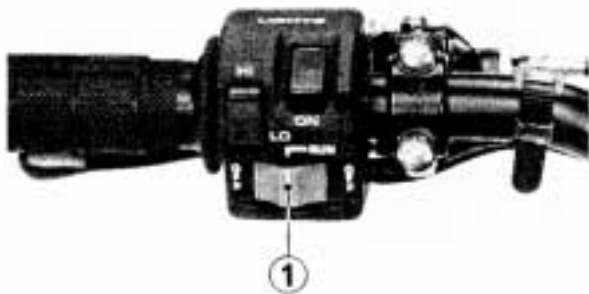
(1) Ignition switch

The three position ignition switch (1) is under the headlight switch. At RUN, the engine will operate. In either OFF position engine will not operate.