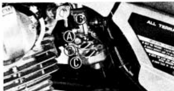
(6) Choke lever (B) Detent position (A) Fully closed (C) Fully open