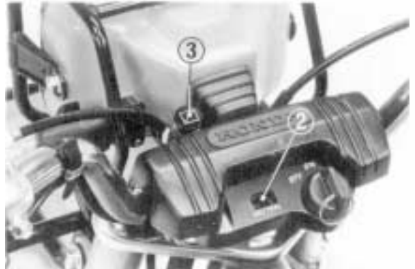
(2) Neutral indicator lamp

To restart a warm engine, it is not necessary to use the choke.