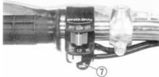
(7) Starter button