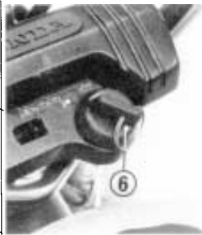
(6) Ignition switch