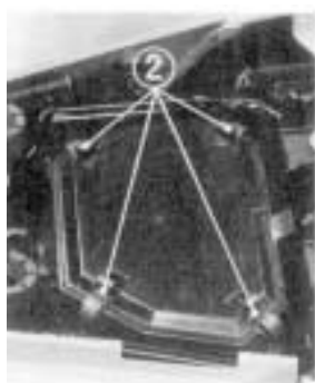
(2) Retainer clips