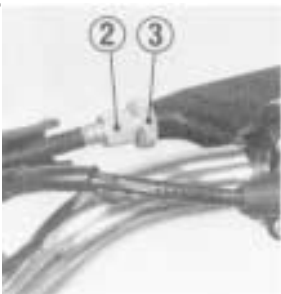
(2) Upper adjuster