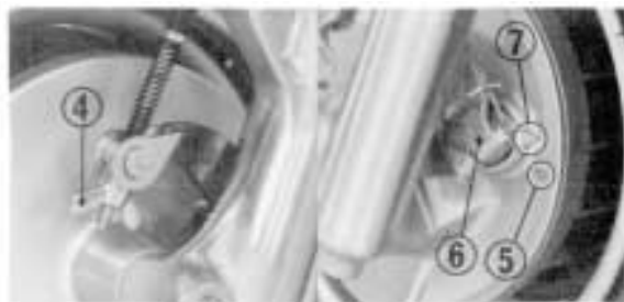
(4) Lower adjuster

If the arrow aligns with the reference mark on full application of the brake, the brake shoes must be replaced. See your authorized Honda dealer for this service.