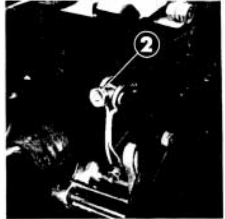
② Adjusting nut