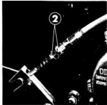
② Adjusting nuts