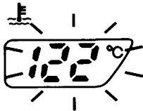
(2) Malfunction indicator