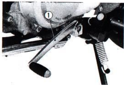
① Gear change pedal

Shifting down in gear is accomplished by lifting up the gear change pedal in successive sequence.