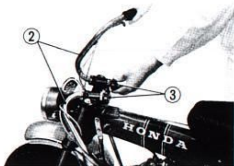
② Handle bars ③ Handle bar knobs