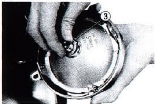
③ Headlight bulb.