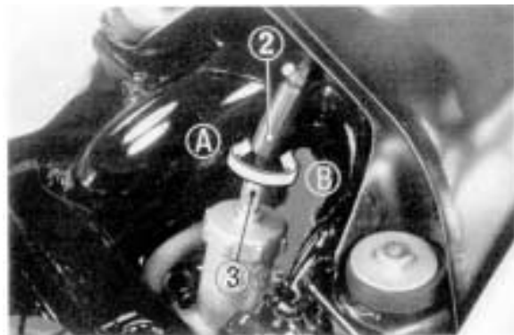
(2) Rubber sleeve (3) Cable adjuster

The cable adjuster (3) is located on top of the carburetor. Slide the rubber sleeve (2) back to expose the throttle cable adjuster (3). Turn the adjuster to obtain the correct free play. Reinstall the sleeve after adjustment.