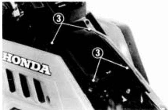
(3) Retainer clips