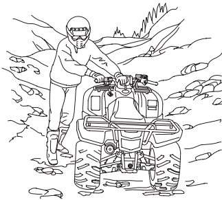
Be sure your legs are clear of the wheels.

If the hill is not too steep and you have good footing, you may be able to walk the ATV back down the hill. Make sure your intended path is clear in case you lose control of the ATV.