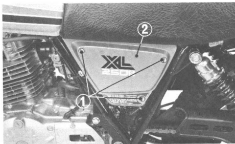
(1) Screw (2) Air cleaner cover