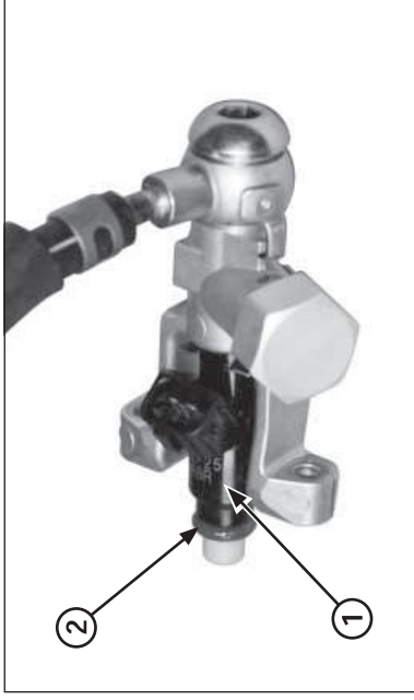
(1) INJECTOR (2) NEW O-RING

If the injector does not operate, replace the injector.