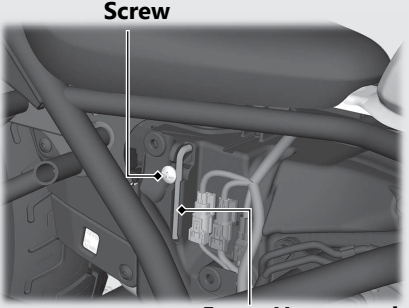
5 mm Hex wrench

To remove the 5 mm Hex wrench, loosen the screw with a coin.