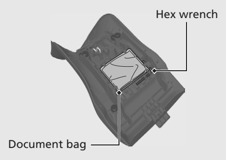
Removing the front seat ( P98

The document bag and hex wrench are located on the underside of the front seat.