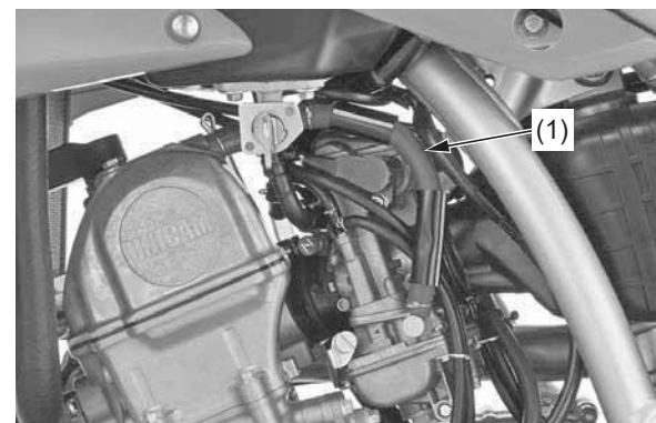
(1) fuel line