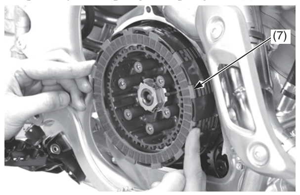
(7) clutch discs, clutch plates, judder spring and spring seat

7. Remove the seven clutch discs, six clutch plates, judder spring and spring seat (7).