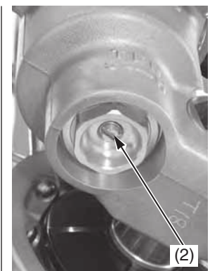
(1) compression damping adjuster(2) rebound damping adjuster