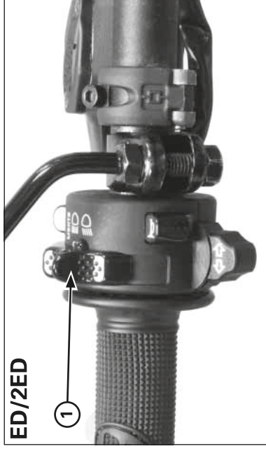
(1) HEADLIGHT DIMMER SWITCH

Operate the throttle grip to ensure that it functions smoothly and returns completely in all steering position.