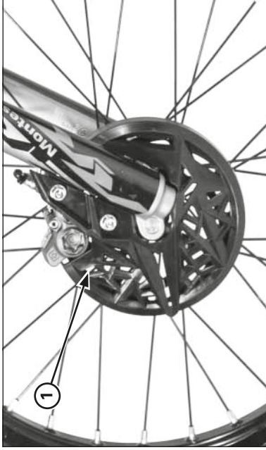
(1) BRAKE DISC

If either pad is worn, both pads must be replaced.