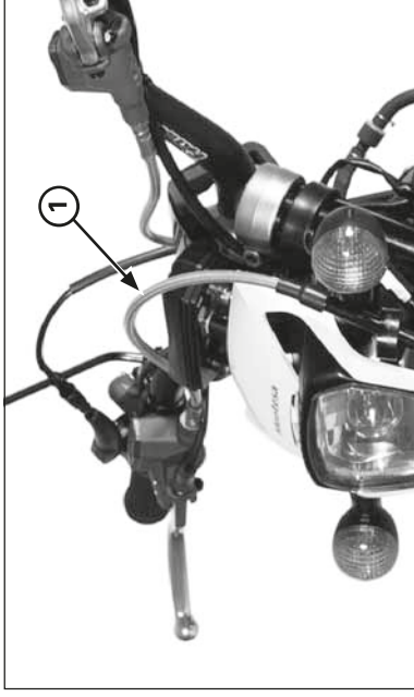
(1) BRAKE HOSE

Check that the brake hose do not bind or kink in all steering position, and is not pulled when the suspension is extended.