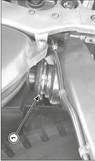
(1) PRE-LOAD ADJUSTER