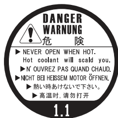
1.1 radiator cap danger