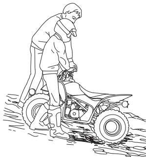
Body position for backing down a hill.