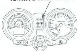
OIL PRESSURE WARNING INDICATOR

If the indicator does not come on, inspect as follows.