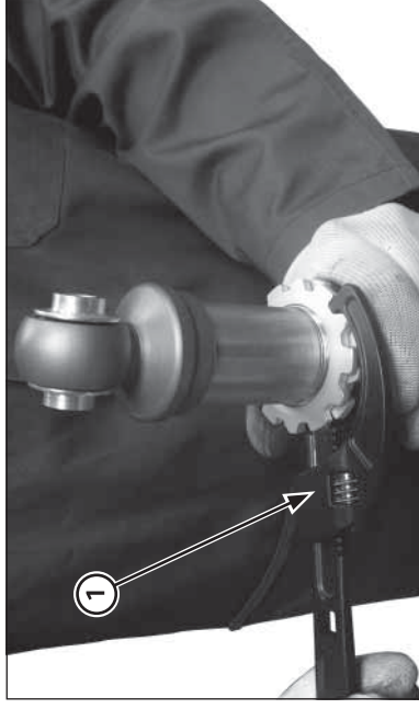
(1) SPANNER WRENCH